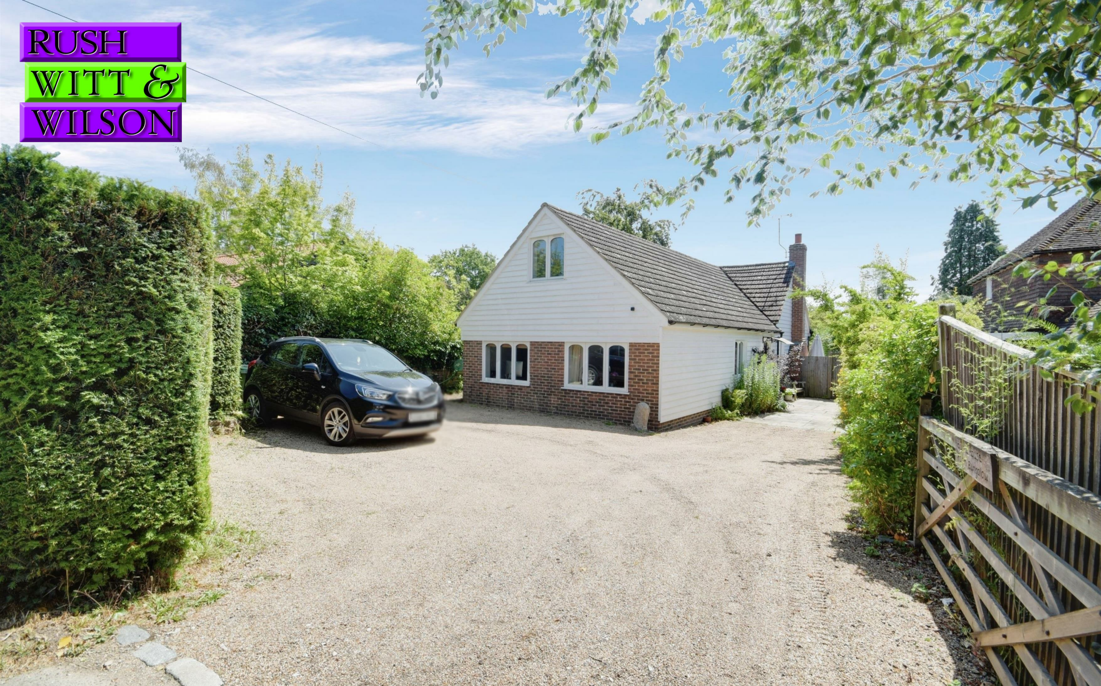
Burnt House Bungalow, Rye Road, Sandhurst, Kent, TN18 5JL. £495,000 Freehold